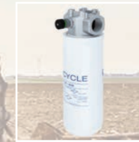
FA4 HIGH PRESSURE SPIN ON FILTER