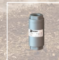
FLC PRESSURE FILTER