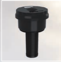
FB AIR FILTERS FILLER BREATHER