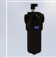
FH420 IN LINE HIGH PRESSURE FILTER