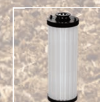
WG926 INTERCHANGEABLE FILTER ELEMENT