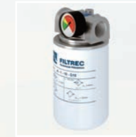
FA1 SPIN ON FILTER