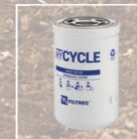
A411G10 SPIN ON FILTER ELEMENT