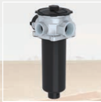
FR6 TANK TOP RETURN FILTER