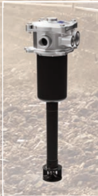
FRM TANK TOP RETURN FILTER