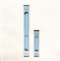
FL FLUID LEVEL GAUGE