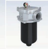
FR1 TANK TOP RETURN FILTER