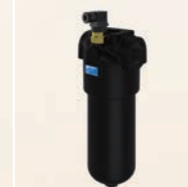
F280 IN LINE HIGH PRESSURE FILTER