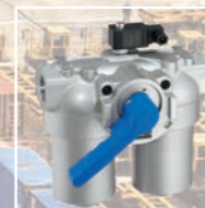
FDD040 040_400 DUPLEX LOW PRESSURE FILTER