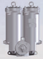
KMSD7 DUPLEX STRAINER DISC FILTER

At the same time, Filtrec support the marine companies goal of protecting both equipment and the environment.