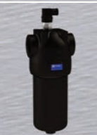
FH420 IN LINE HIGH PRESSURE FILTER