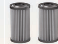
WG511 FILTER ELEMENT TRANSMISSION KIT