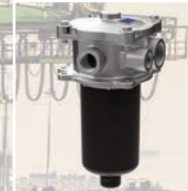
FRM TANK TOP RETURN FILTER