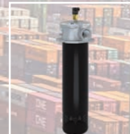
FCR7 TANK TOP RETURN FILTER