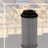
WG540 PRESSURE FILTER ELEMENT