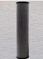
E7 METAL FREE FILTER ELEMENT