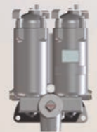
KMSX4 DUPLEX PLEATED ELEMENT FILTER