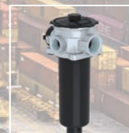
FR6 TANK TOP RETURN FILTER