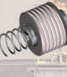
KMS INSERT STRAINER DISKS TYPE