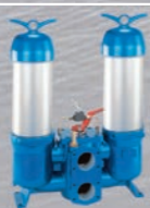
FDD040 630-1000 DUPLEX LOW PRESSURE FILTER